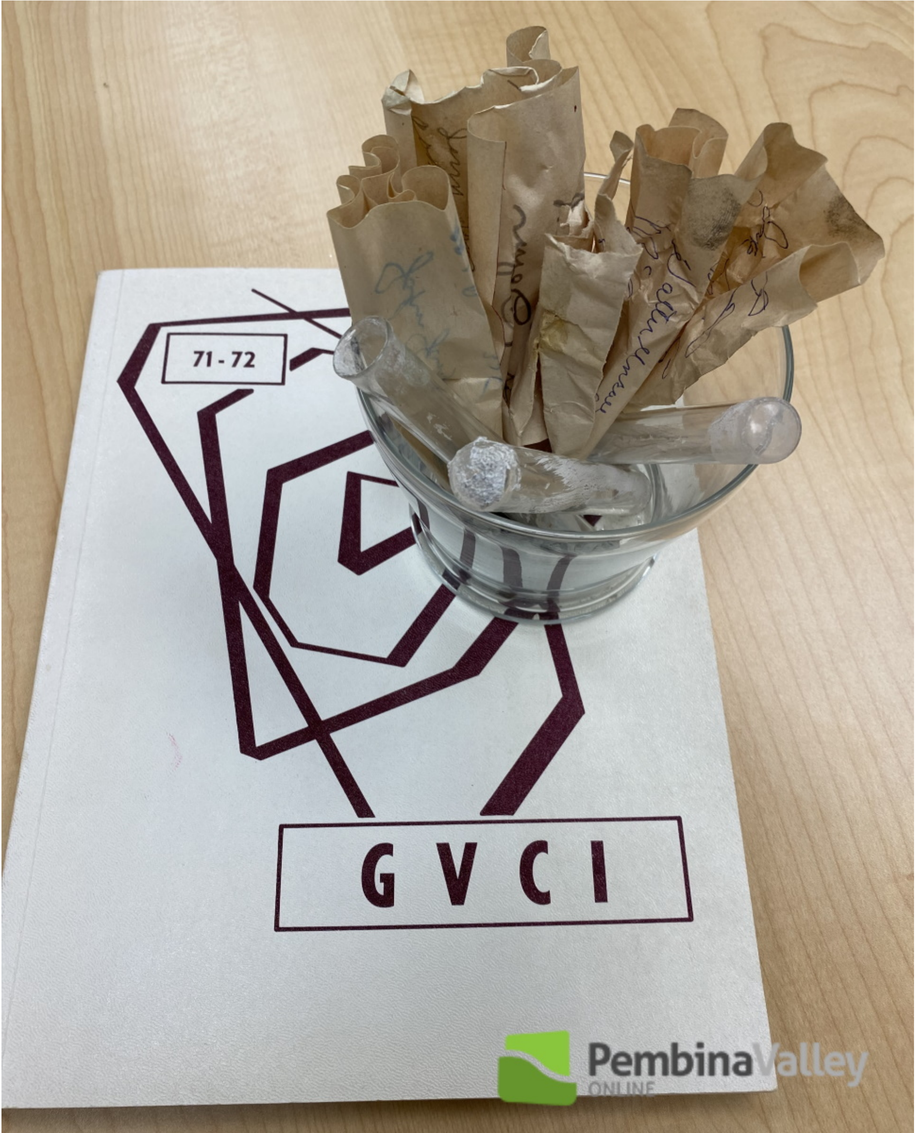
The glass vials and their contents along with a yearbook from 1971-72